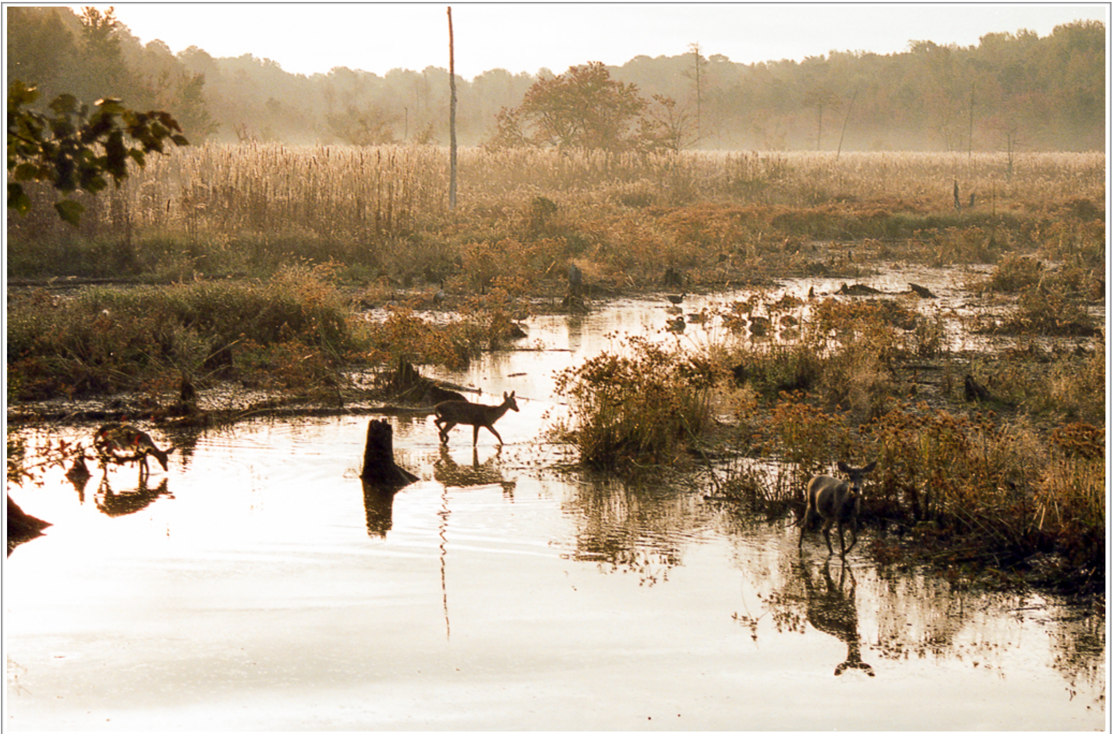
Deer at sunrise