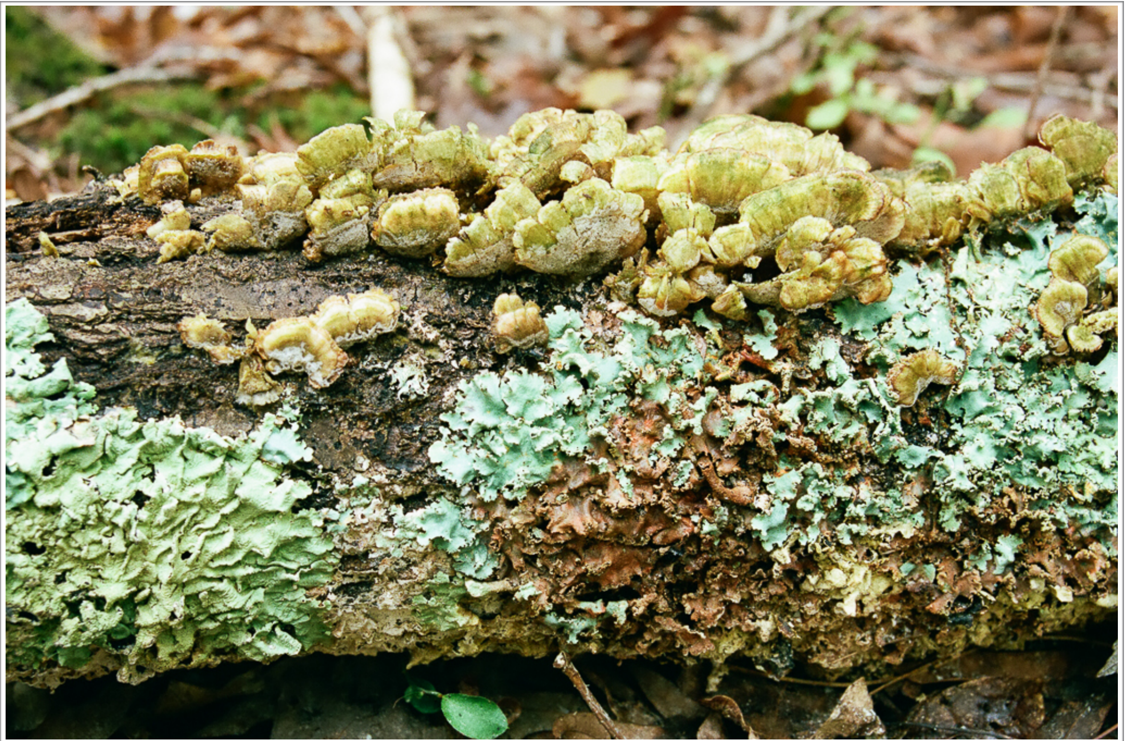
Moss and mushrooms