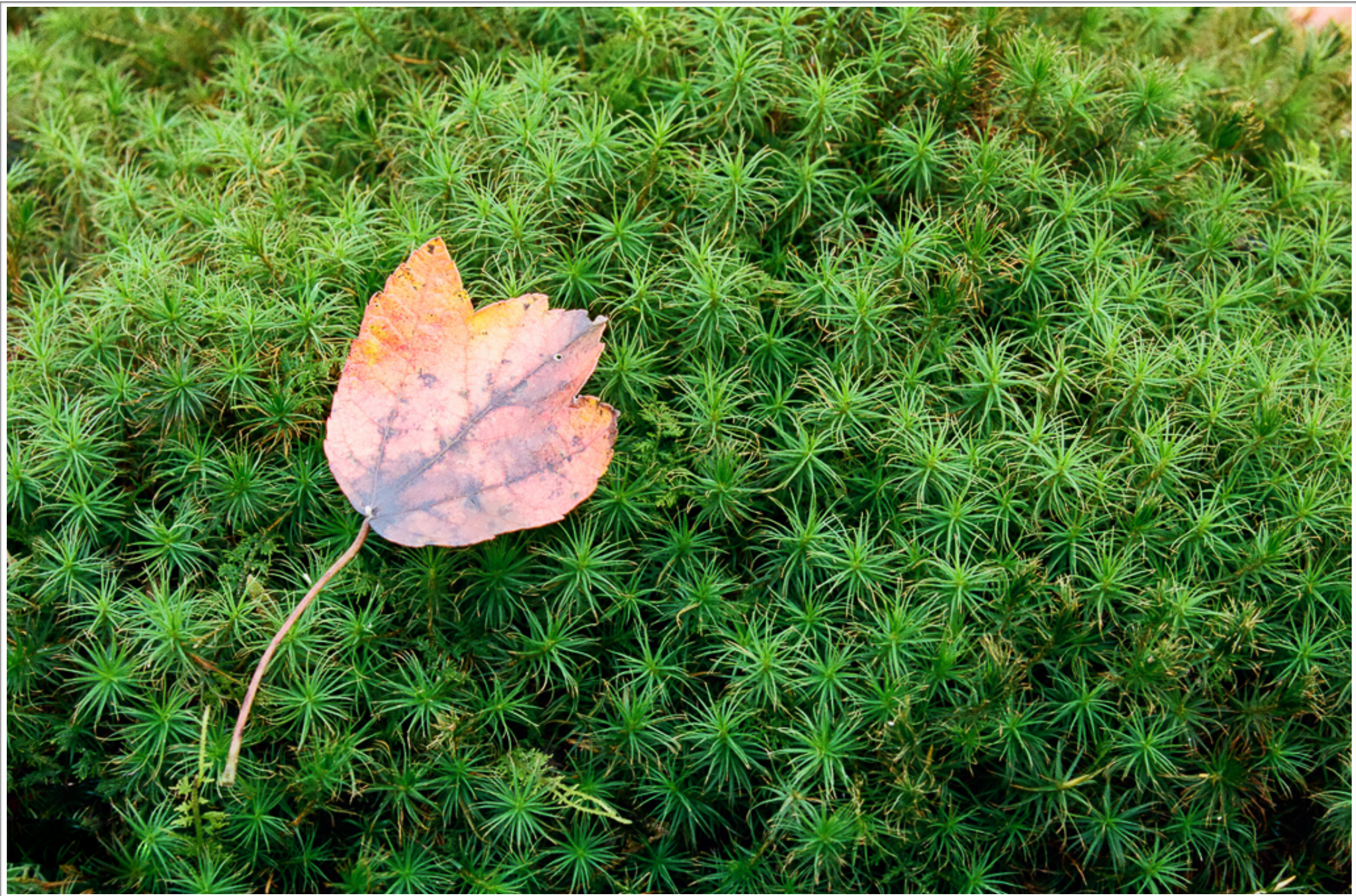
Leaf on moss